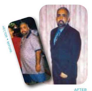
"Isagenix® helped me reach one of my dreams - to be a referee for an international soccer game. As of now, I have lost 104 pounds* and dropped 10 waist sizes. My health improved a lot and my agility also."

"I was a 74-year-old, 267-pound retired vascular surgeon at the end of the line. No energy, ambition or desire to do anything. At the end of the third week of using the Isagenix® Cleansing and Fat Burning System, I woke up and bounced out of bed full of energy and feeling better than I had in 20 years. I lost a total of 70 pounds* ... and have remained at that weight loss for over a year."